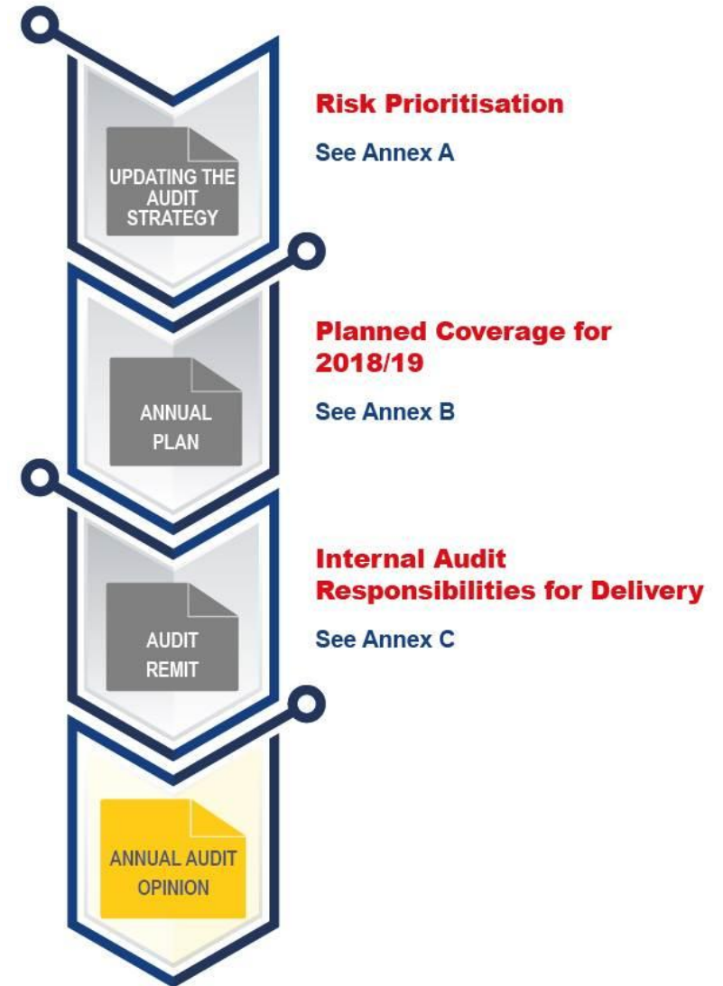
Figure 1 – 2018/19 Audit planning process

The Audit Plan for 2018/19 provides the level of coverage to enable a head of audit annual opinion to be made on the overall adequacy and effectiveness of the organisation’s framework of governance, risk management and control as required by the Public Sector Internal Audit Standards (PSIAS).